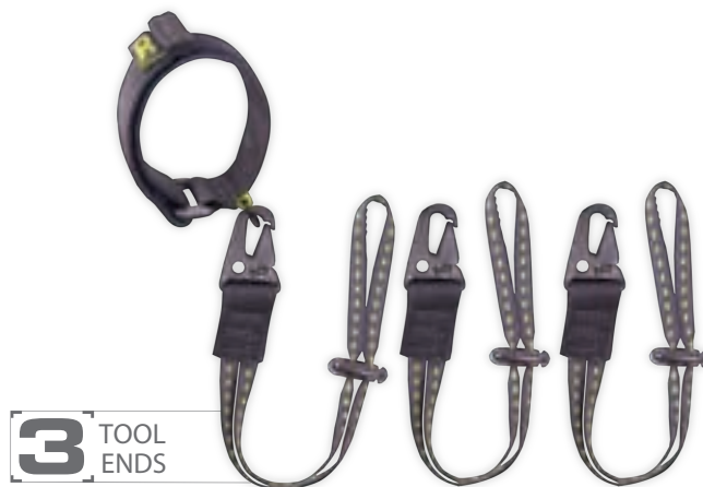
3 TOOL ENDS