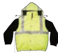
4 Jacket without sleeves and with liner (Deluxe vest)