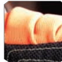
› HIGH DENSITY EVA PADDING