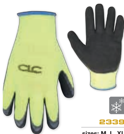
2339 sizes: M, L, XL