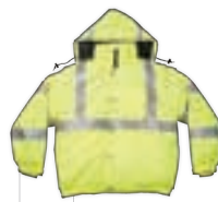
2 Jacket with sleeves and without liner (Partially insulated jacket)