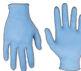
2320 Pre-Powdered 2322 Non-Powdered sizes: S, M, L, XL