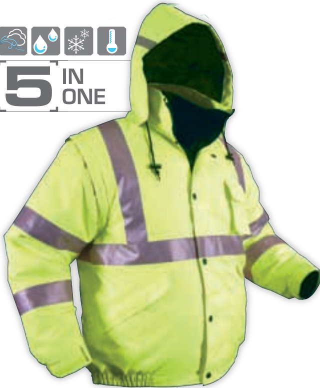
1 Jacket with sleeves and fleece liner (Fully insulated jacket)