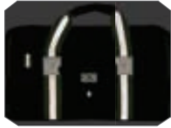
Light reflective elements add to visibility. (low light photo)

» Refer to a CLC Sales Representative to see the entire line of CLC Hi-Viz Gear™ or visit our web site at www.gocl.com .