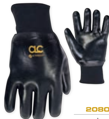
2080L sizes: L