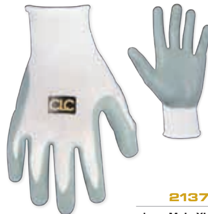
2137 sizes: M, L, XL