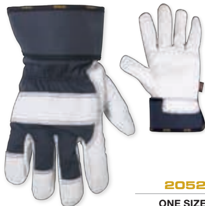
2052 ONE SIZE