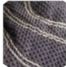
› KEVLAR® PALM WITH PVC DOTS