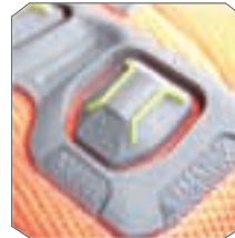
› TPR KNUCKLE PADS