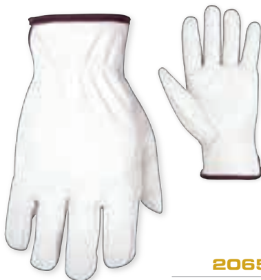
2065 sizes: S, M, L, XL