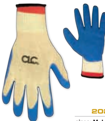
2027 sizes: M, L, XL