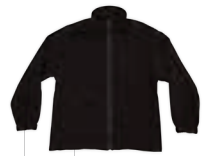
5 Liner without jacket (Light-weight fleece jacket)