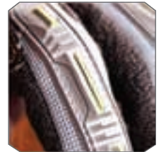
› TPR FINGER PADS