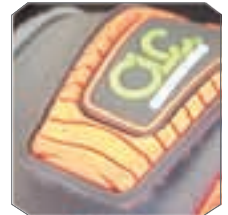
› THICK TPR WRIST STRAP