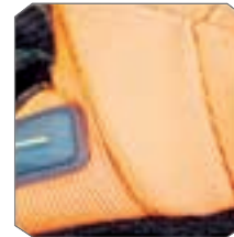
› FULLY PADDED THUMB