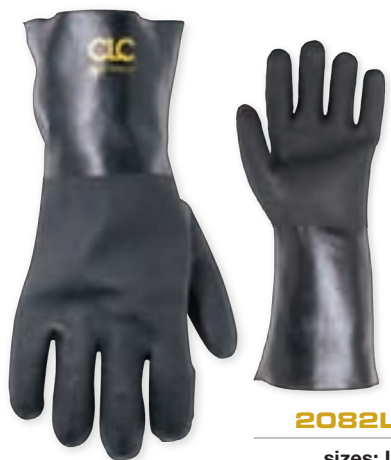
2082L sizes: L