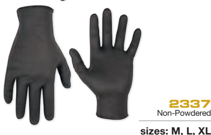
2337 Non-Powdered sizes: M, L, XL